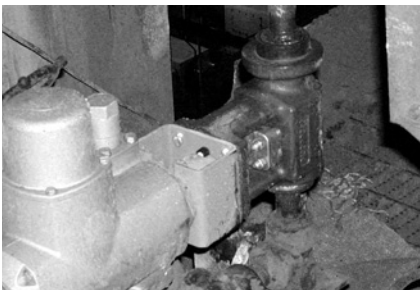
This ASME 4500 Class RSVP convection vent valve was designed to handle extremely high pressure and elevated temperatures coming from the boiler.

2 F22 not recommended for prolonged use above 1100°F / 593°C per ASME B16.34.